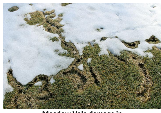
Meadow Vole damage in lawn after snow melt