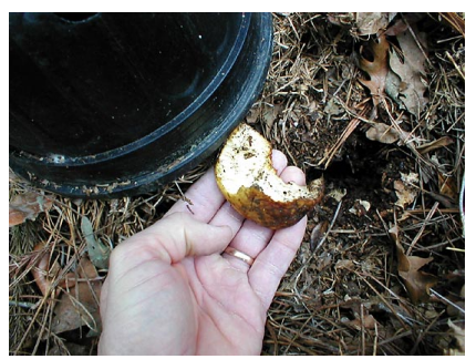
"Apple Sign" Test

(Note: If ants are preventing you from having a successful Apple Sign Test, then remove the apple and substitute about a tablespoon of a mixture of various bird seeds under the pot. Re-check in a couple of days for vole activity.)