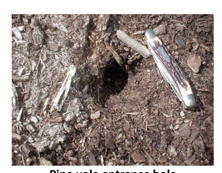
Pine vole entrance hole within hardwood mulch

The first place to start your control efforts for voles, is to locate their Active Entrance Holes, as there may be burrows and tunnels in your yard that are no longer active. The "Apple Sign Test" was developed to detect vole populations before damage becomes severe and reduces the exposure of nontarget animals to control activities. Because the test shows where control is needed, areas without voles are not treated, saving time, money, and environmental risk.