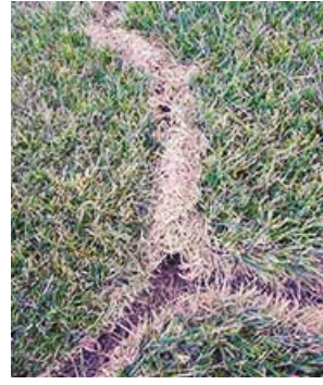
Meadow Vole grassy pathway

Pine voles cause damage by eating flower bulbs, stems of woody plants, and roots. Careful observation beneath damaged vegetation may reveal entrance holes, and a network of tunnels and feces. The trunks of small trees, shrubs, and perennials may be severed from the roots, making it possible to pull the top of the plant out of the soil, or the plant may fall over by itself. When the damage is extensive, the plant will be severely weakened and die due to root damage or disease organisms.