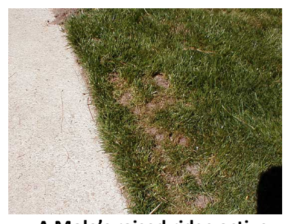
A Mole's raised ridge active tunnel along a driveway

To determine if a mole's tunnel is an active or foraging tunnel you will do the "Broomstick Test". Take a broomstick and poke a hole every 10' apart within the moles' tunnel system. Moles like a closed tunnel system and will repair the opening in their active tunnel within a couple of days whereas they will not repair their foraging tunnels. It's possible to press down all the mole's tunnel system and the tunnel that is raised will be considered active. Control efforts should only be made in the active tunnel.