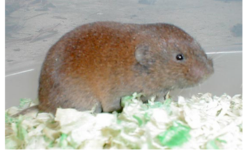
Pine Vole

Pine voles spend most of their life feeding on roots underground in burrow systems, and may come above ground at night to feed on fruit and tender green vegetation. A pine vole tends to stay in an area as small as 1,000 square feet for its entire life.