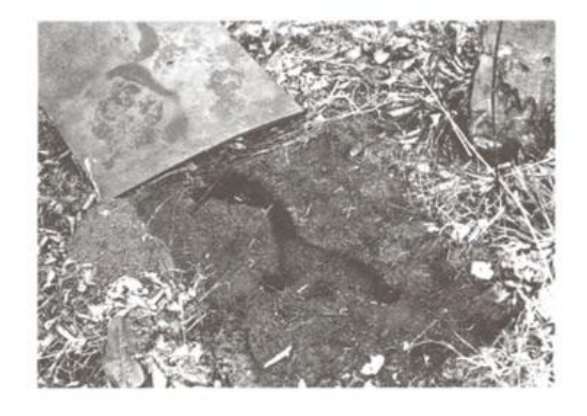
Tunnels made by pine voles under a shingle at an IPM monitoring site.

To monitor for meadow voles, the shingle must be rounded in a tent-like fashion or propped up 3 to 4 inches off the ground over an entrance hole or a grassy pathway, so that the animal can go under it. After five days, place a small slice of apple under each shingle. After 24 hours, check to see if the apple has been removed or eaten. You may leave the shingles in place for future monitoring. When monitoring has been completed, a control action can be directed to the locations where vole damage may occur rather than to the entire planting.