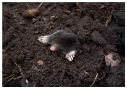
Eastern Mole

Moles eat earthworms, grubs, and insects. As moles tunnel, they make visible raised tunnel ridges, volcano shaped mounds of soil, and have a closed tunnel system without an entrance hole.